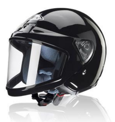
Open face - included