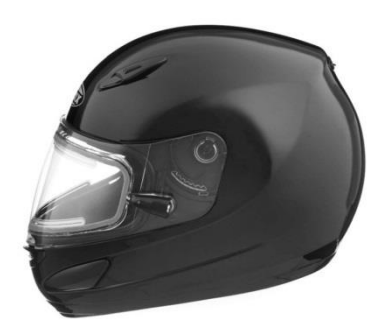
Full face with electric shield Additional charge